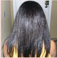
ONE TREATMENT OF ENVIE